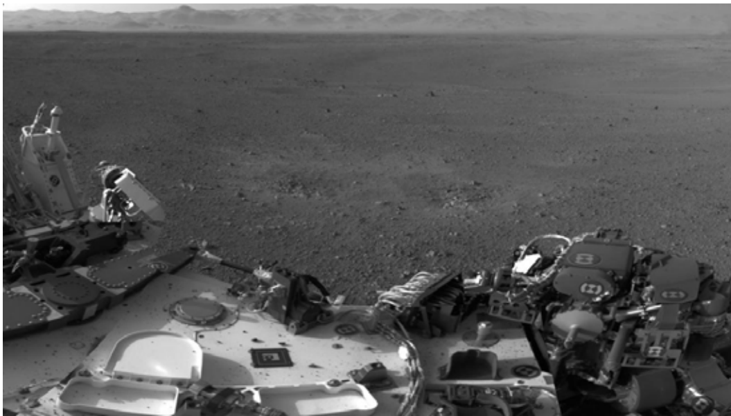
Part of the left side of NASA's Curiosity rover and two blast marks from the descent stage's rocket engines. Rim of Gale Crater in the distance. 10 August 2012

Election Day is on 6 November. Tell your policy makers now what is important to you and to the nation. And tell them again on Election Day.